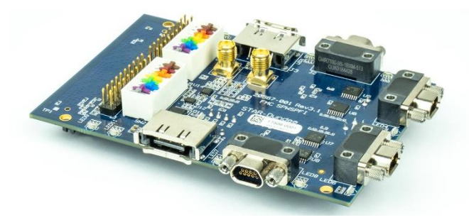
FMC SpaceWire/SpaceFibre Board Mk3

The FMC interface is keyed to orientate the board away from the carrier board.