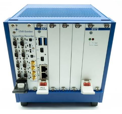
SpaceWire Recorder Mk2

The SpaceWire Recorder Mk2 is a complete computer rack system. It consists of a cPCI chassis containing STAR-Dundee's SpaceWire Recorder board, a powerful CPU card with two solid-state disks, and a power supply.