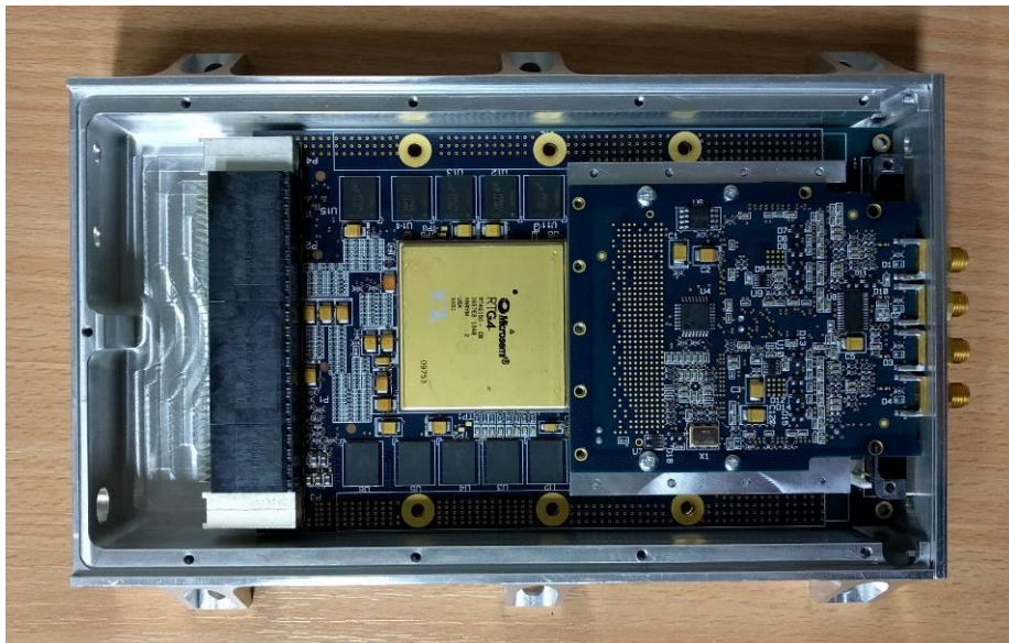
Figure 3 SpaceVPX-RTG4 Board with Dual ADC FMC card fitted

Attached to the RTG4 are two banks of 32-bit wide DDR memory. A pair of SpaceWire and a pair of SpaceFibre connectors are provided on the front panel of the SpaceVPX-RTG4 board. To provide additional input/output functions an FMC connector is provided on the board. The SpaceVPX-RTG4 can be configured as either a system controller or a payload module, with SpaceWire or SpaceFibre control plane connections.