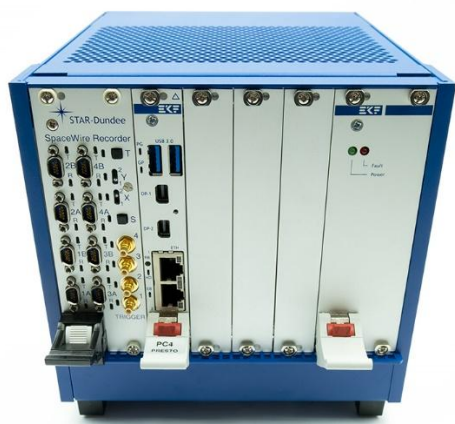
SpaceWire Recorder Mk2

The SpaceWire Recorder Mk2 is a complete computer rack system. It consists of a cPCI chassis containing STAR-Dundee's SpaceWire Recorder board, a powerful CPU card with two solid-state disks, and a power supply.