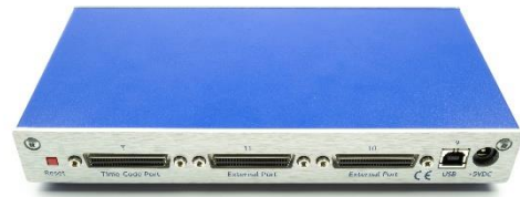
SpaceWire Router Mk2S Rear Panel

USB compatibility: The device is a standard USB 2.0 device, supporting transfers at up to 480 Mbit/s. It can also be used in USB 3.0 ports, or USB 1.1 ports at lower data rates.