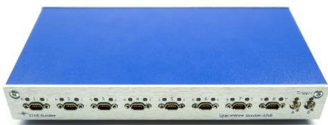
SpaceWire Router Mk2S

Error injection: Parity errors, escape errors and credit errors can all be injected on demand, while transmitted packets can be terminated with an EEP.